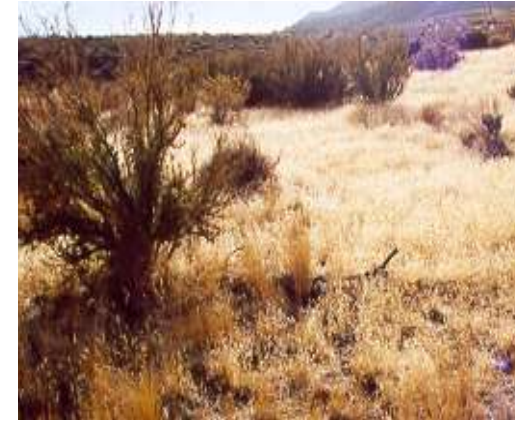
Crested wheatgrass suppresses weeds. Note that the weed “cheatgrass” (light colored vegetation in the background) is not growing in the area seeded with crested wheatgrass (foreground).

Crested wheatgrass can usually be grown in areas that receive more than eight inches of precipitation a year and where the naturally occurring vegetation is big sagebrush, pinyon, or juniper. It does not grow well in areas with excessively alkaline or heavy clay soils.